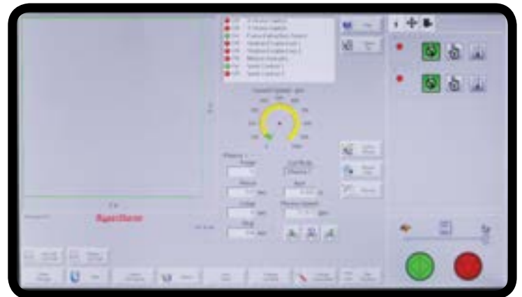
Phoenix 10 with Soft Operator's Console