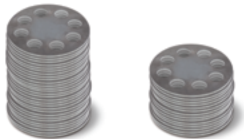
With Rapid Part

When purchasing a new cutting table be sure to ask about cut-to-cut cycle time. Some cutting table manufacturers are able to deliver similar results using their own CNC, THC, and nesting software products combined with Hypertherm plasma systems.