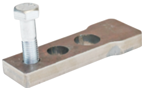
With True Hole technology

As part of Hypertherm's SureCut™ technology, True Hole® for mild steel produces significantly better hole quality than what has been previously possible using plasma. Equally important, True Hole technology is delivered automatically without operator intervention, to produce unmatched hole quality.